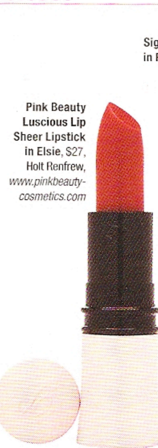
Pink Beauty Luscious Lip Sheer Lipstick in Elsie, $27, Holt Renfrew, www.pinkbeauty-cosmetics.com