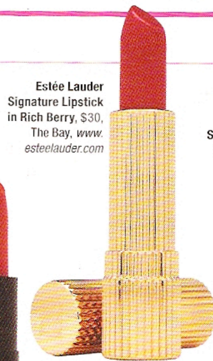
Estée Lauder Signature Lipstick in Rich Berry, $30, The Bay, www.esteelauder.com