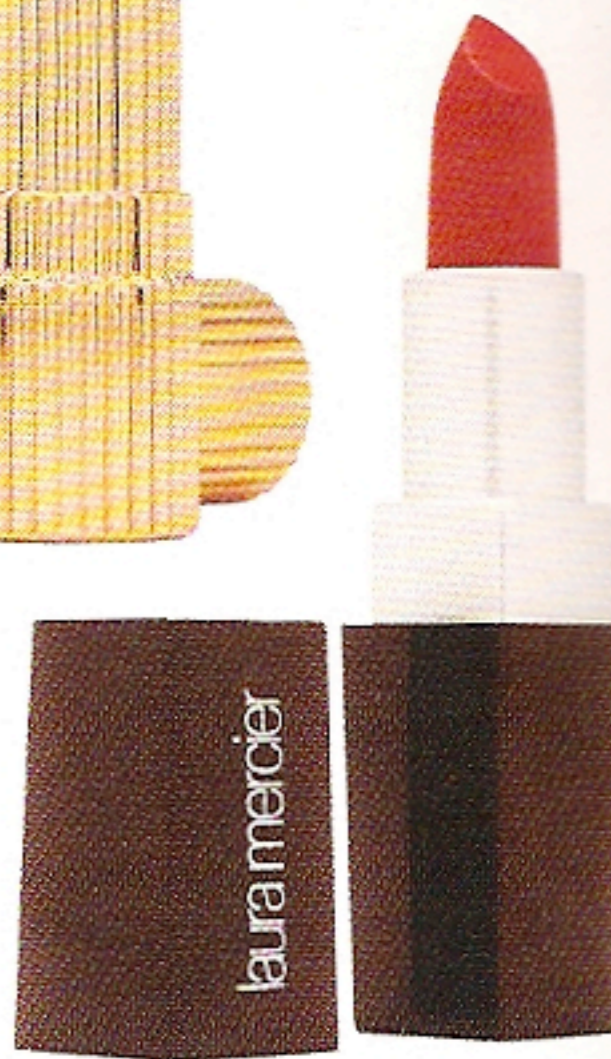
Laura Mercier Shimmer Lip Colour in Seduction, $26, Holt Renfrew, www.lauramercier.com