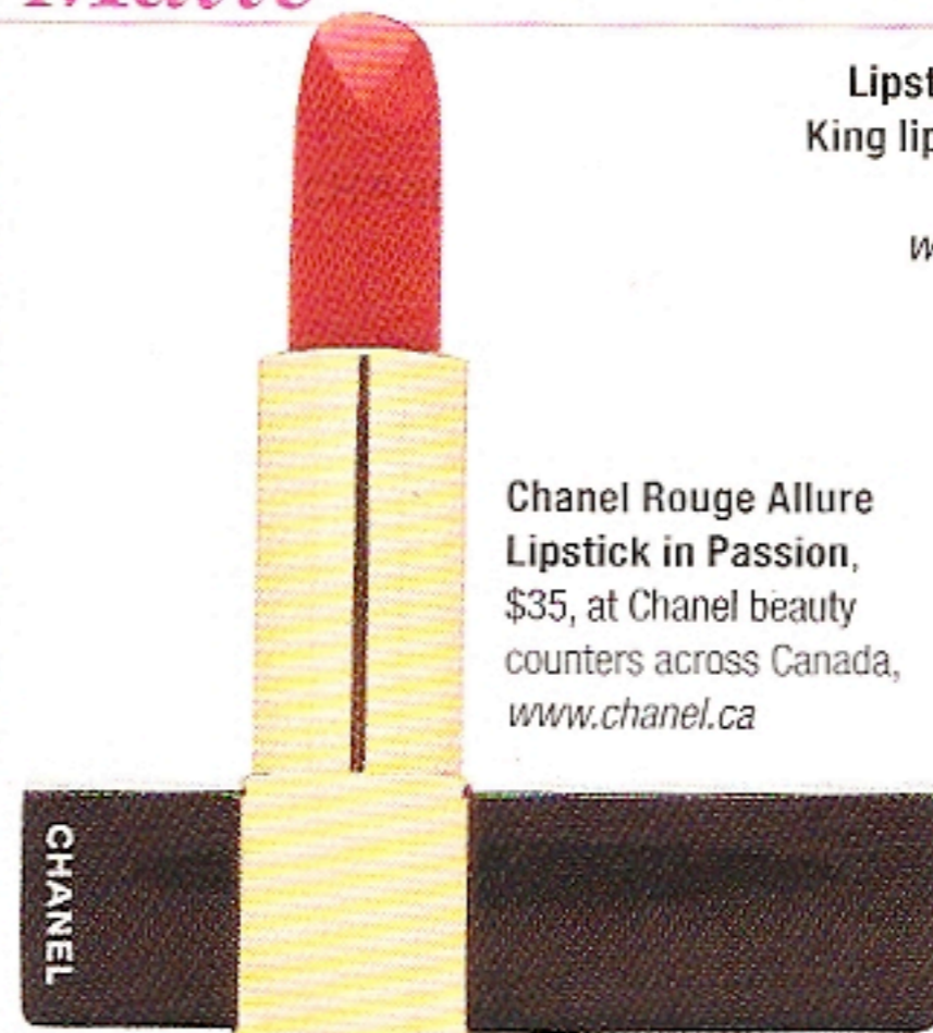
Chanel Rouge Allure Lipstick in Passion, $35, at Chanel beauty counters across Canada, www.chanel.ca