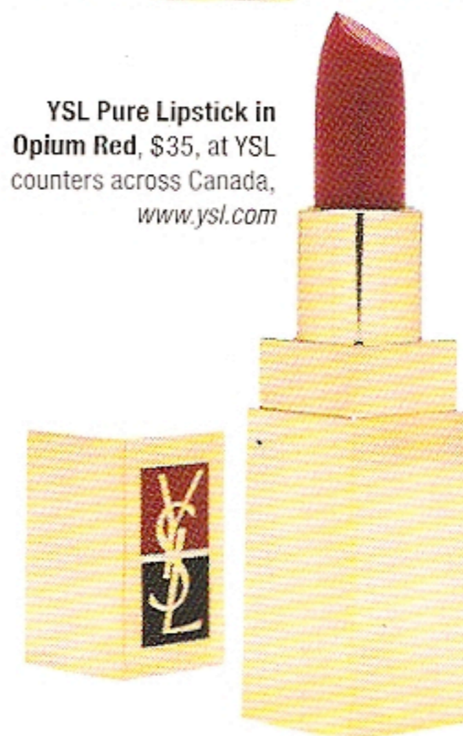
YSL Pure Lipstick in Opium Red, $35, at YSL counters across Canada, www.ysl.com