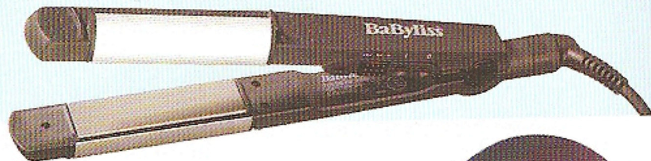
You Curl, E by BaByliss (0870 513)

No more getting in a twist with complicated curling tongs, these babies take you to basics. Just smooth the irons through your hair, twisting as you go, and your locks will be transformed into bouncy waves. It's the same principle as running scissors over paper ribbon to create spirals. Genius!